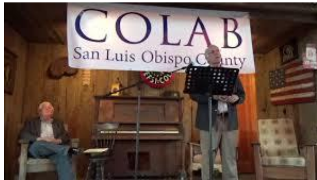
VICTOR DAVIS HANSON ADDRESSES A COLAB FORUM